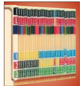
Note that AZ 124 is a misfile.

alpha-numeric filing is simply the filing of letters and numbers in a format that suits the file situation. Many times, files have alphabetical indicators which have a particular meaning in a numeric file, or vice versa. When filing alpha-numeric files, a decision must be made as to whether the number or the letter is more important for locating or segregating the file, since the file can be set up either way. An example of alpha-numeric filing (at left) shows a construction company using the alpha prefix of the state in which the construction site is located. In the illustration, IL (postal abbreviation) is for the state of Illinois, job number 123. Job number 124 has the indicator AZ, showing that the construction site is in Arizona, which is a misfile. The files are kept in alphabetical order by state, then in numerical order by job numbers which are assigned in sequence as construction sites become available. Alpha-numeric files need not be complicated; numbers or letters used in an alpha-numeric file can give added dimension for presorting, filing and retrieval.