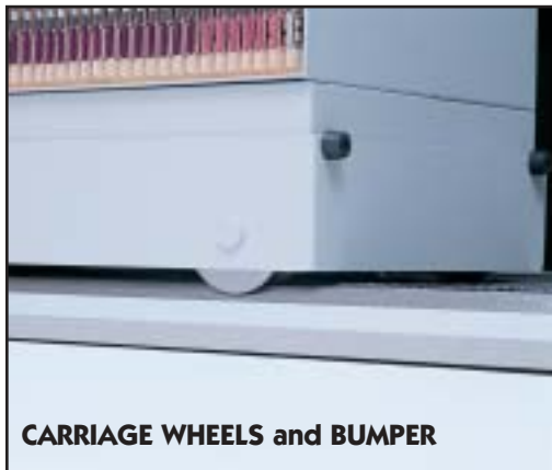
CARRIAGE WHEELS and BUMPER