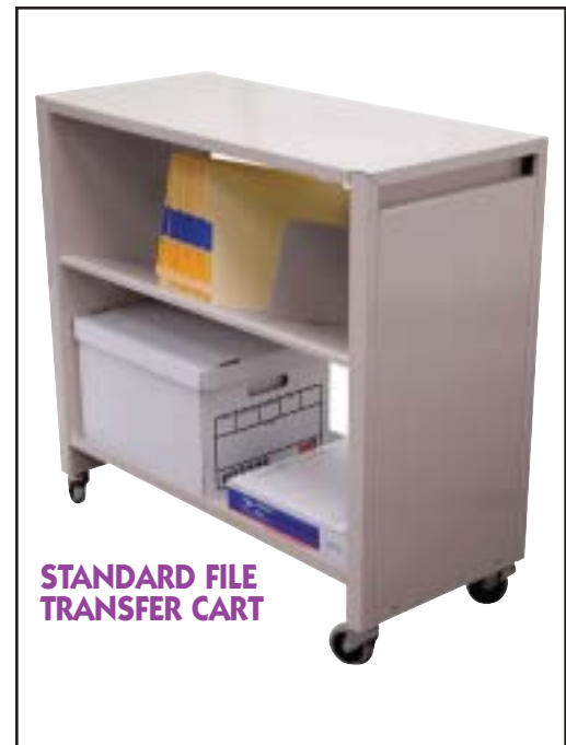
STANDARD FILE TRANSFER CART