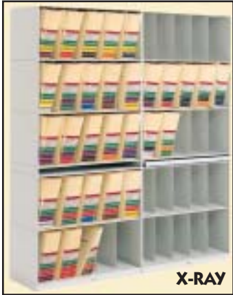
CALL FOR PRICING ON X-RAY SHELVING