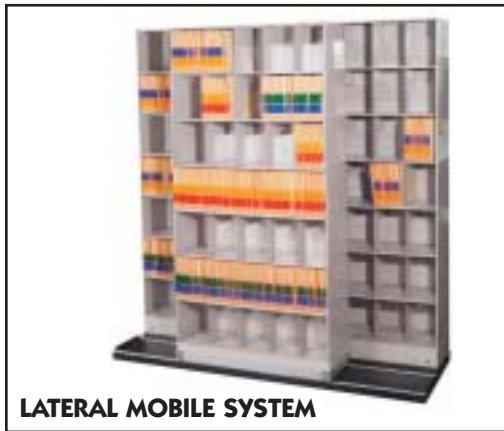
LATERAL MOBILE SYSTEM