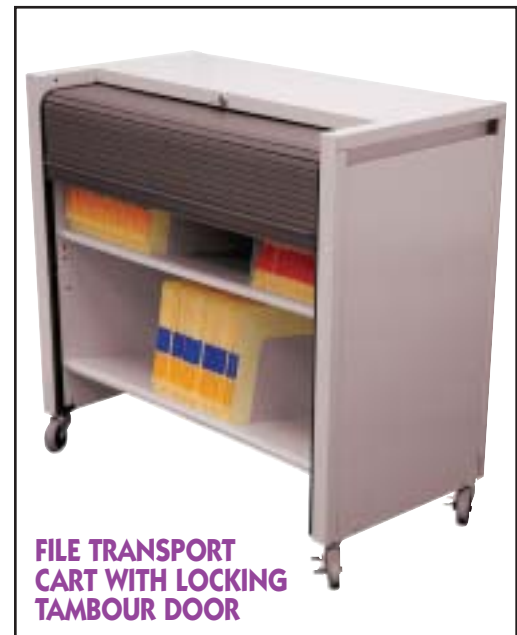
FILE TRANSPORT CART WITH LOCKING TAMBOUR DOOR