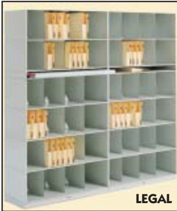
CALL FOR PRICING ON LEGAL SHELVING