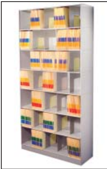
OPEN SHELF FILING CABINET