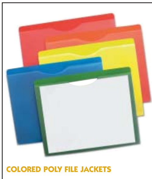
COLORED POLY FILE JACKETS