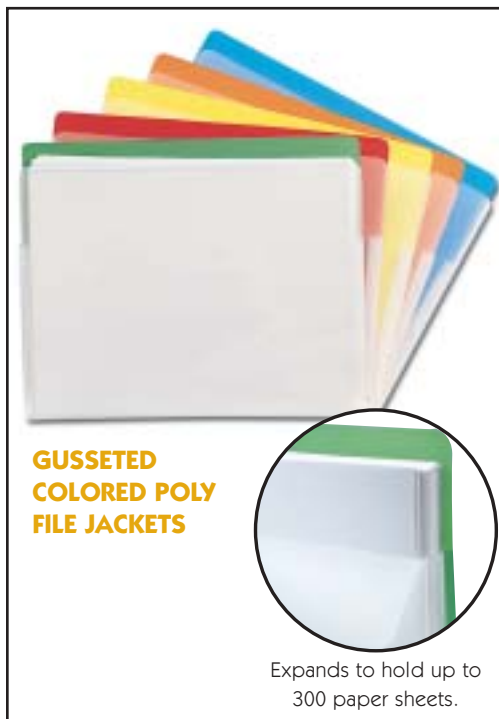
GUSSETED COLORED POLY FILE JACKETS